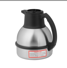
THERMAL CARAFE, BLK 1.9L 12PK